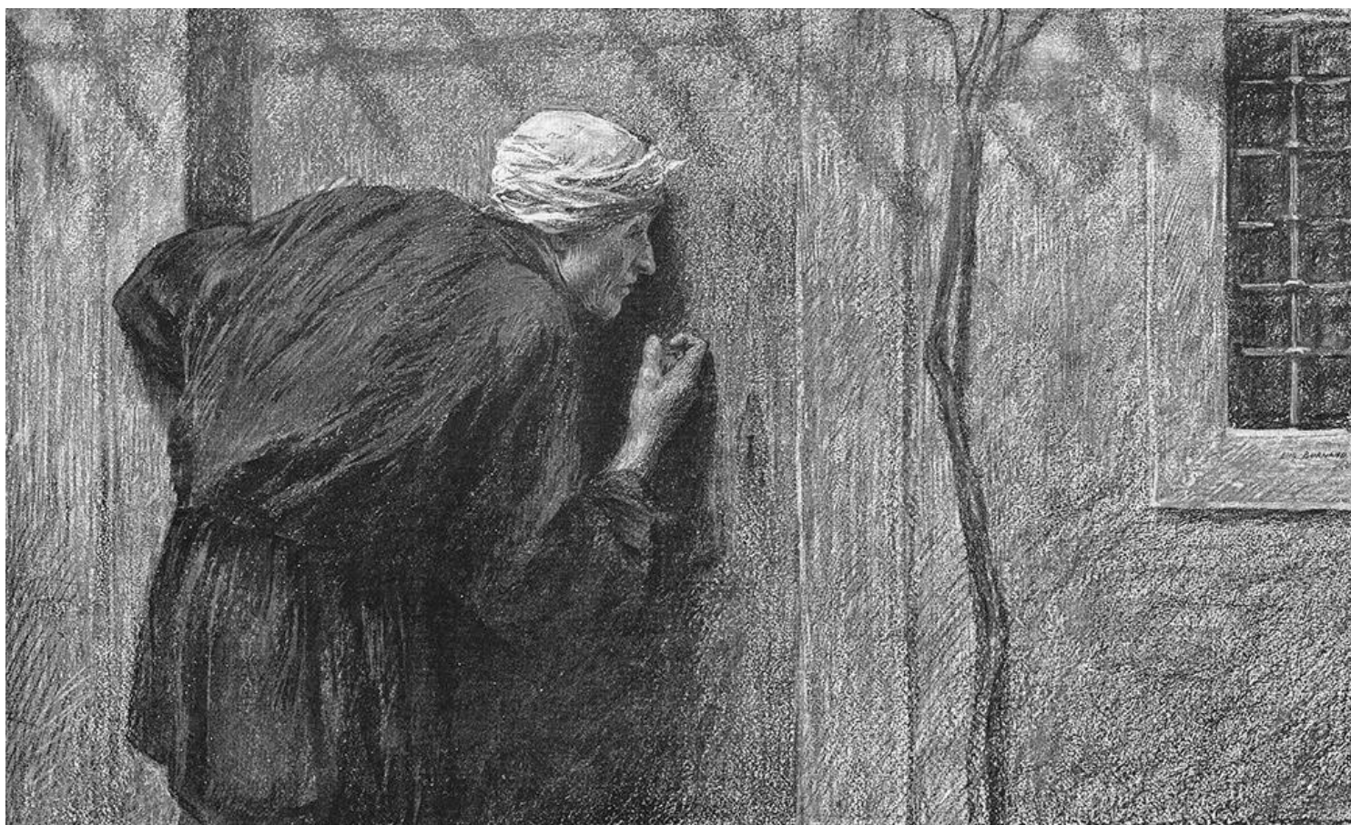
The Importunate Neighbor , Eugene Burnand, from his "Les Paraboles" series, pub. 1908

The Seventh Sunday after Pentecost Holy Eucharist, Rite II July 27 th , 2025 at 10:30 am