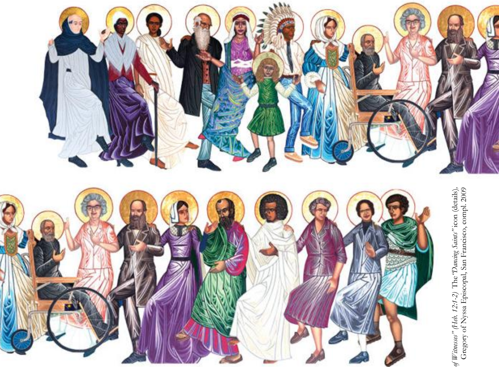
"A Great Cloud of Witnesses" (Heb. 12:1-2) The "Dancing Saints" icon (details), Gregory of Nyssa Episcopal, San Francisco, compl. 2009

The Tenth Sunday after Pentecost Backpack Sunday Holy Eucharist, Rite II August 17, 2025 at 10:30 am