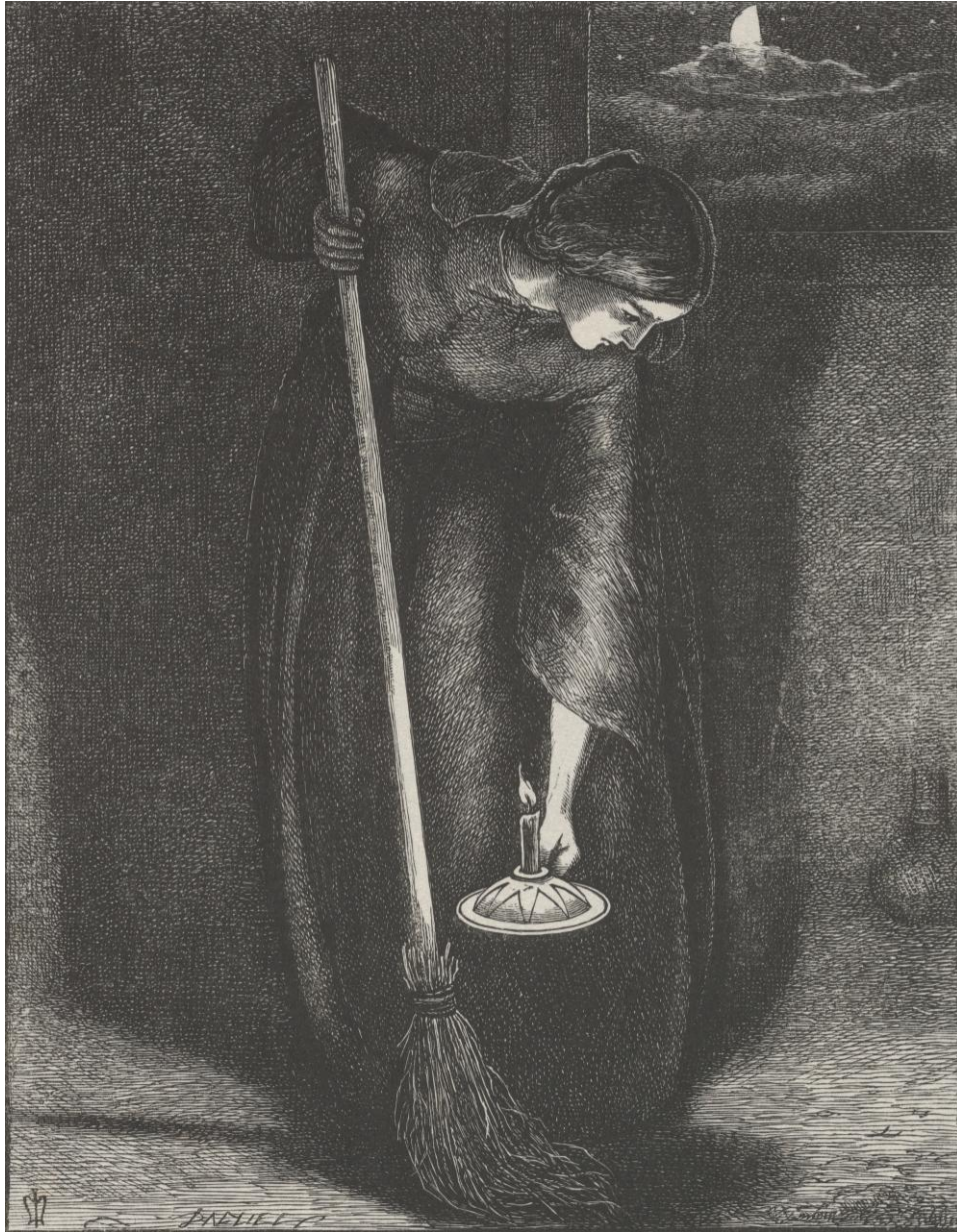
The Parable of the Lost Coin , John Everett Millais, 1864.

The Fourteenth Sunday after Pentecost Holy Eucharist, Rite II September 14, 2025 at 10:30 am