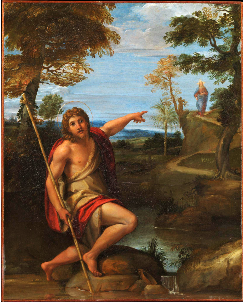
Saint John the Baptist Bearing Witness - Anibale Carracci (1560-1609)

The Second Sunday of Advent Holy Eucharist, Rite II December 07, 2025 – 10:30am