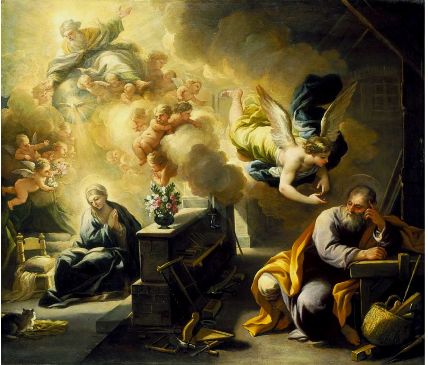
The Dream of St. Joseph - Luca Giordano (1634-1705)

The Fourth Sunday of Advent Holy Eucharist, Rite II December 21, 2025 – 10:30am