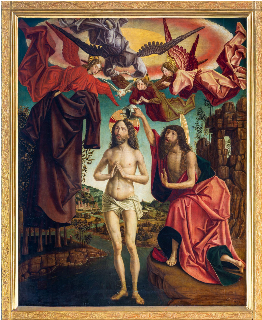
Der Taufe Christi, from the altarpiece of St. Wolfgang im Salzkammergut - Michael Pracher (1441)