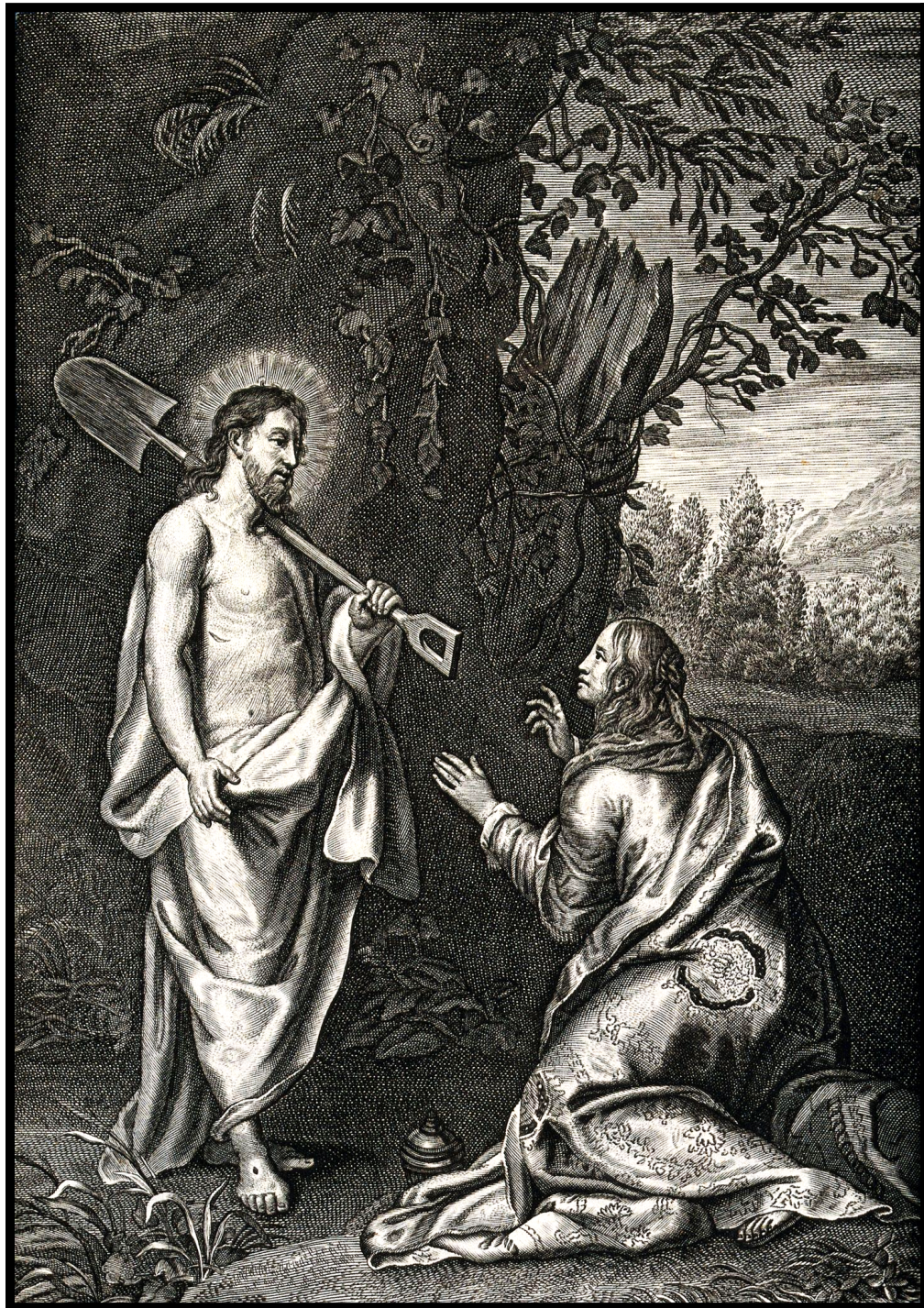
Christ Appearing to Mary Magdalene as a Gardener, Unknown engraving (18th Century)