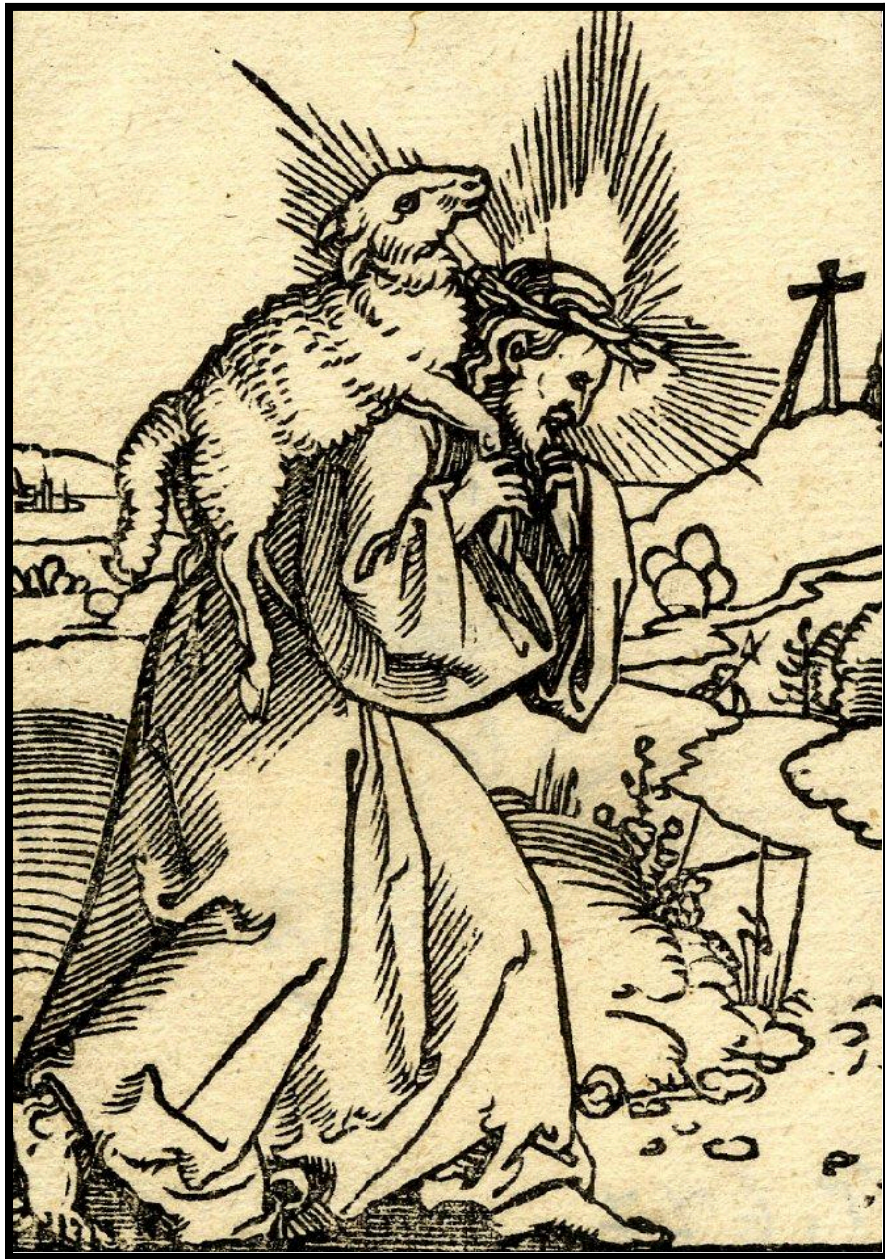
Woodcut of Christ carrying the Lamb (Luther Prayerbook, 1527)