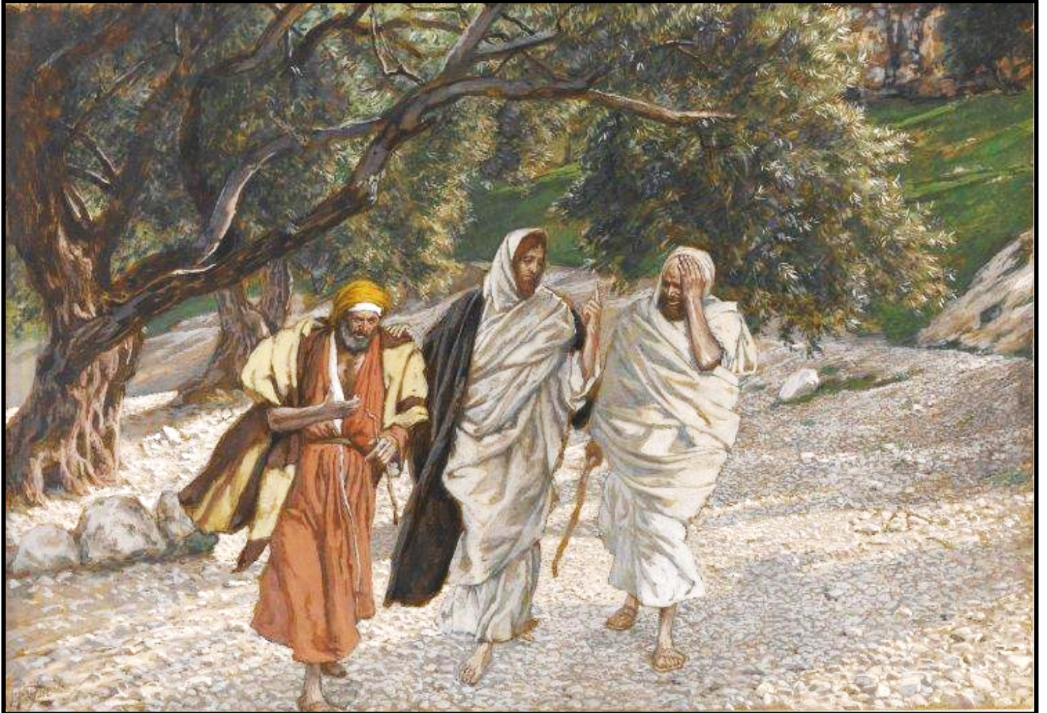
Les Pelerins d'Emmaüs en Chemin - James Tissot (1836-1902)

Third Sunday of Easter Holy Eucharist: Rite II April 19, 2026 – 10:30am