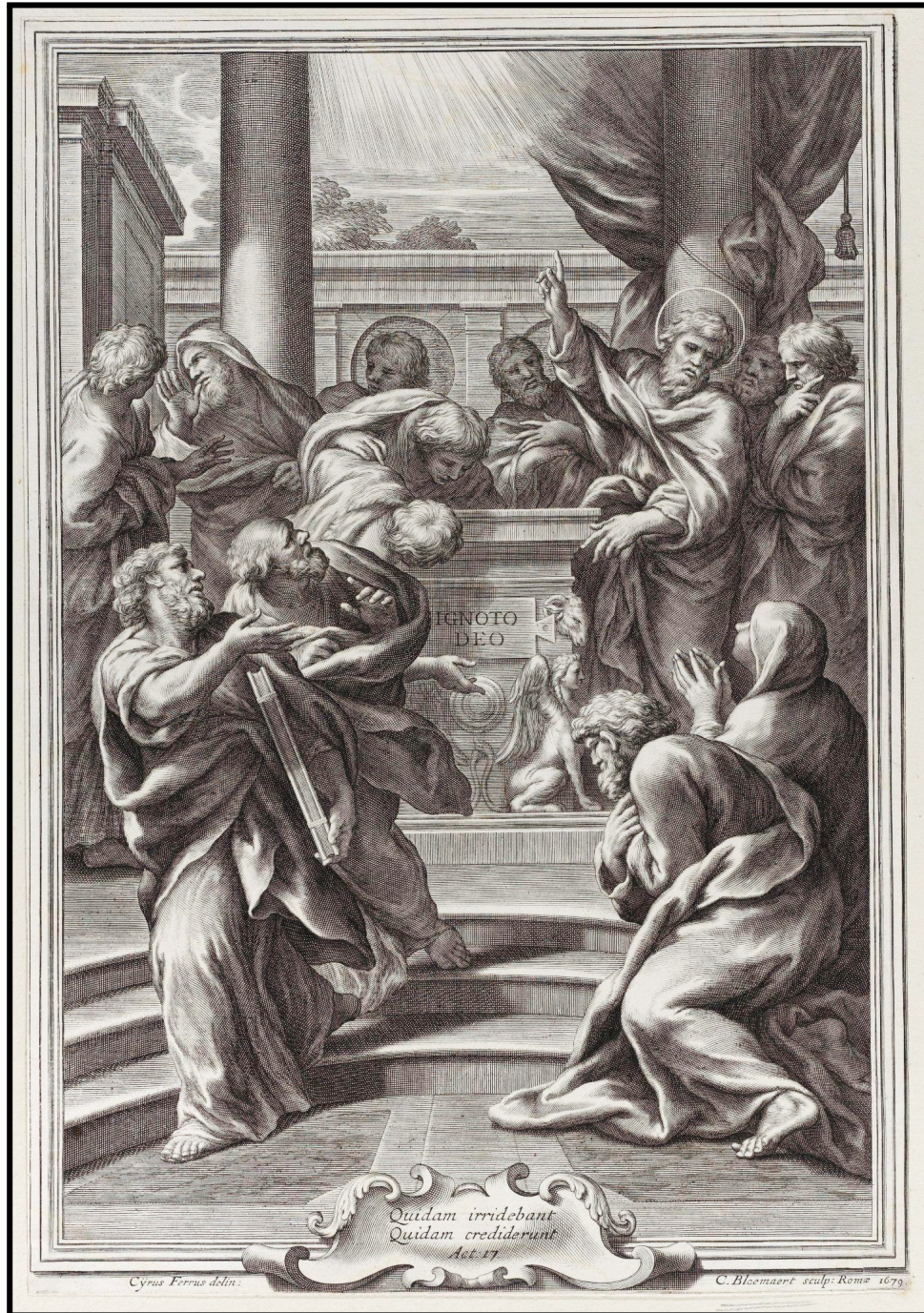
St. Paul Preaching in Athens, Cornelis Bloemaert (1679)