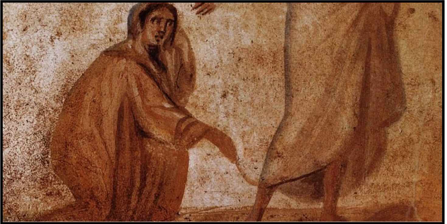
Healing of the Bleeding Woman - Unknown artist, Roman Catacombs, ca.350-400 CE